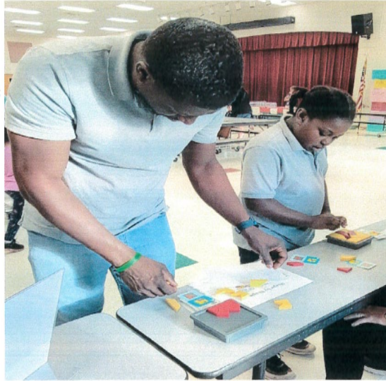
Geometiles: Students will use squares, rectangles, pentagons, and 3 types of triangles to engage in math exploration as they construct 3D models with endless possibilities! This parent is practicing the activity so that he can assist his child with it at home.

We are grateful for every parent that came to our Literacy Night! We hope you enjoy your reading manipulatives that you received (and the socks)! 🧦